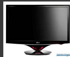
LCD(Liquid crystal display)

34) http://www.letsqodigital.org/tr/24247/led-monitor