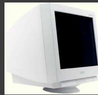
CRT(Cathode Ray Tube)